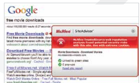
Figure 1. McAfee SiteAdvisor Enterprise solutions provide an intuitive, color-coded safety rating system that provides advanced security warnings.

Innovative McAfee technology automatically monitors the most common online activities, such as using search engines, browsing websites, downloading files, and providing email addresses to sign up for product registrations, services, community access, and newsletters.